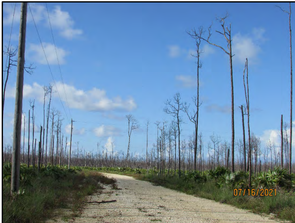
Current conditions of Pines at intersection of Suffolk Road (access road to site) and Grand Bahama Highway. Site is approximately 2.3 miles south.

Please reference Appendix #4 of the EIA and EMP document. Unfortunately, the pine forest in the area and most of east Grand Bahama have already been adversely impacted from the seawater flooding in from Dorian.