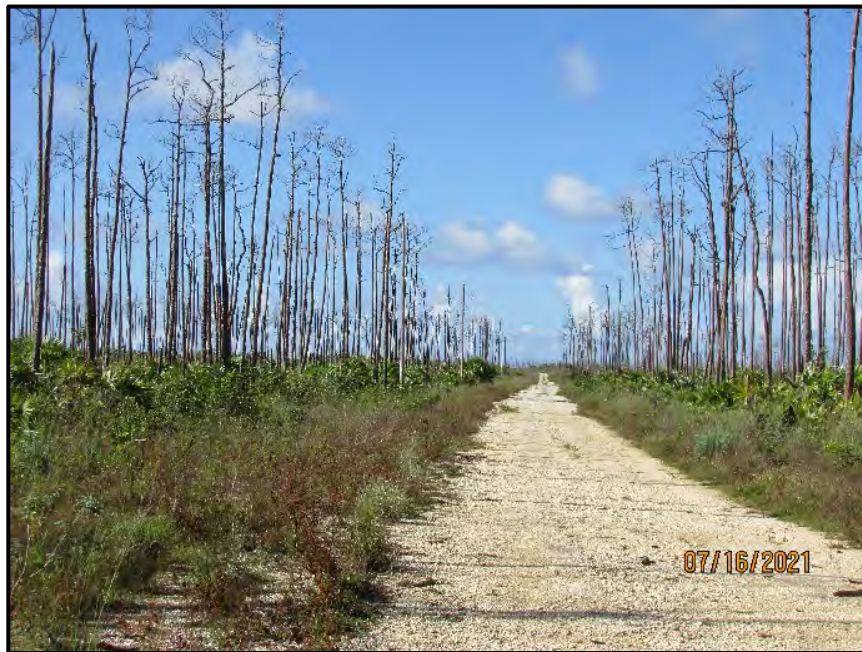
Current condition of Pines on access road to site (approximately 2.3 miles)

Please reference the Terrestrial Resource Study in Appendix 5 of the EIA