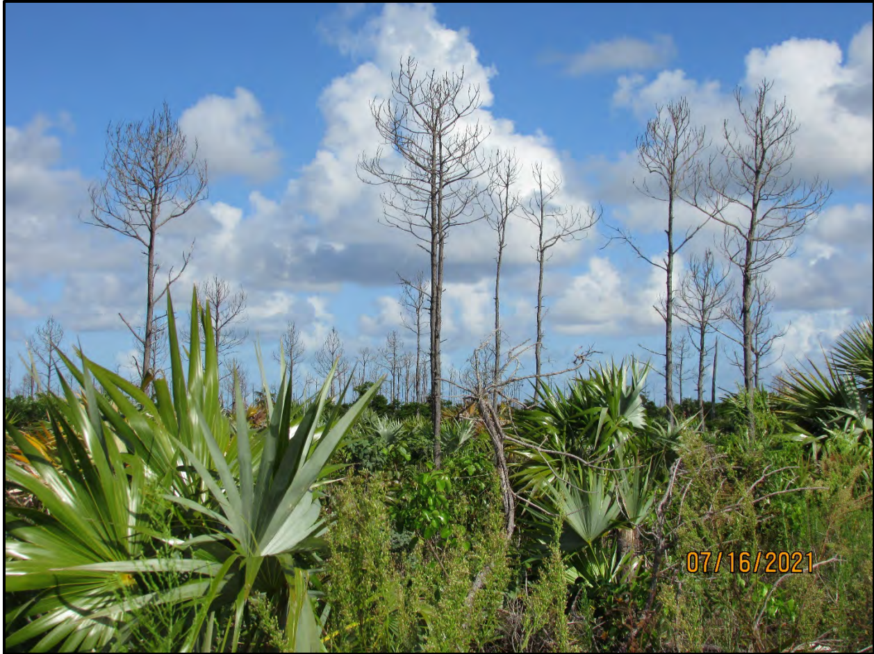
Pines on the property as a result of Dorian